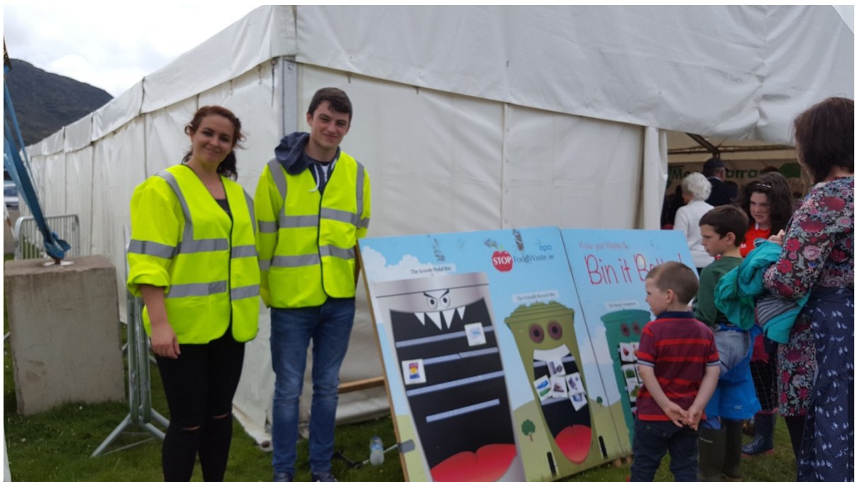
Bin it Better Game