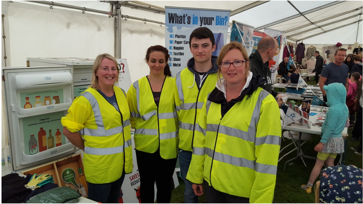
Waste Information Stand