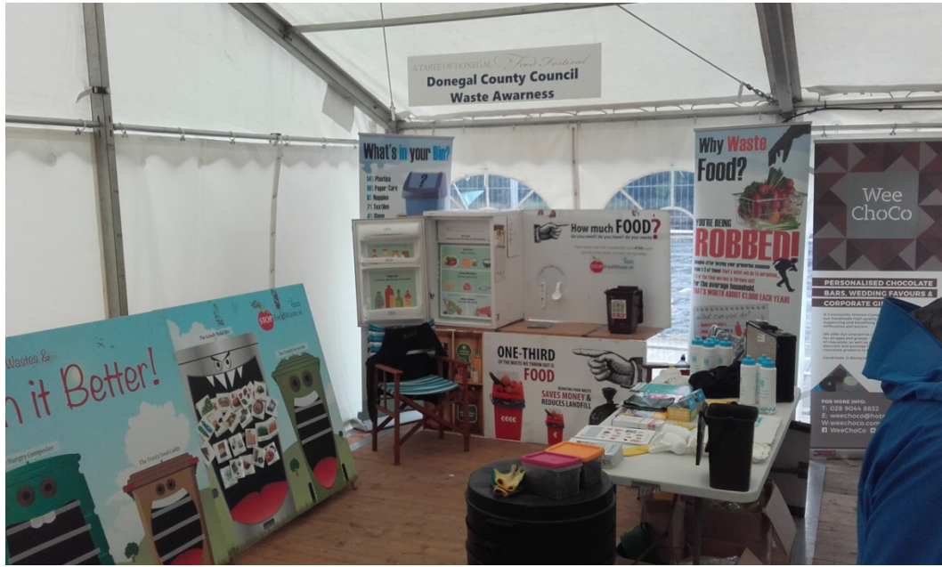
A Taste of Donegal Waste Information Stand